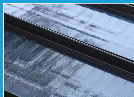
Steep-slope Standing Seam

2590 Walsh Avenue, Santa Clara, California 95051, USA 1.408.919.5700 info@miasole.com www.miasole.com